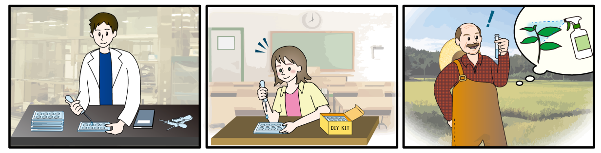
Figure 3. The synthetic fermentation approach as a "Do-it-yourself" method – one that can be done by anyone, anywhere – to synthesize and evaluate millions of organic molecules e.g. farmers to identify new anti-fungal compounds to treat plant diseases.

needed single, pure compounds to do the biological screening. It was only when we looked at the way Nature makes new medicines – by producing dozens of similar compounds together – that we realized we could use our chemistry to do something very similar. By taking this inspiration, we found that we could make thousands of compounds from a few building blocks in a few hours, rather than the months it would normally take."