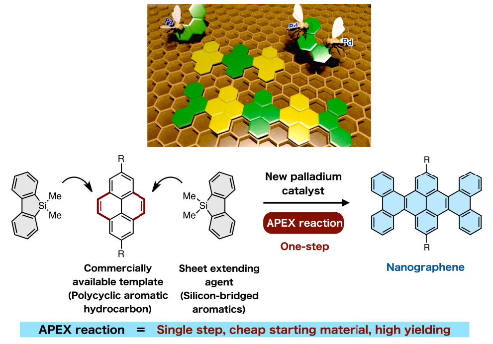
Figure 1. A single-step APEX reaction to synthesize uniform nanographenes. Selective annulation at the 'K-region' leads to direction-controlled synthesis of nanographenes in high yield.