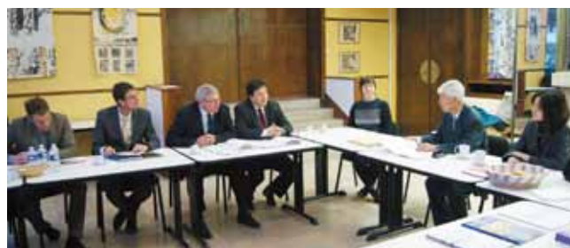
Explaining JSPS programs