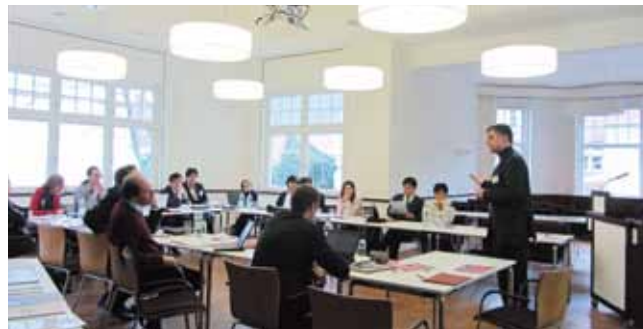
During the discussion