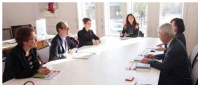
University president welcoming JSPS staff

The office members were also given the opportunity to visit one of the university’s laboratories, named CEISAM (Interdisciplinary