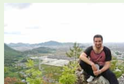
Sitting atop Mt. Kinka

So, I would recommend Gifu to those who are looking for a relaxing holiday or who are interested in history and traditional crafts.