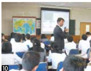
6. Toyama Senior High School 7. Kofu First High School 8-9. Tsuru High School 10. Nobeoka High School