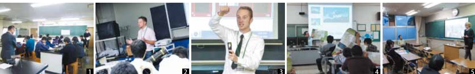
1. Kumagaya High School 2-3. Ichikawa Senior High School 4. Tsukuba Univ. Junior High and Senior High School at Komaba 5. Fujishima Senior High School

Title: "Physics and Gravitational Waves—Study and Research in Germany and Japan"