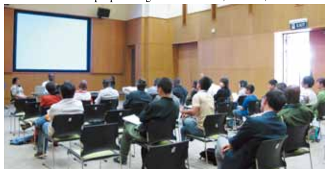
Discussion with participants

The Nairobi National Park is a wildlife preserve located adjacent to Nairobi, East Africa’s largest city. A sizable amount of Kenya’s annual revenue comes from tourism, with the Park contributing significantly to that income. For the people living around the Park, however, wild animals