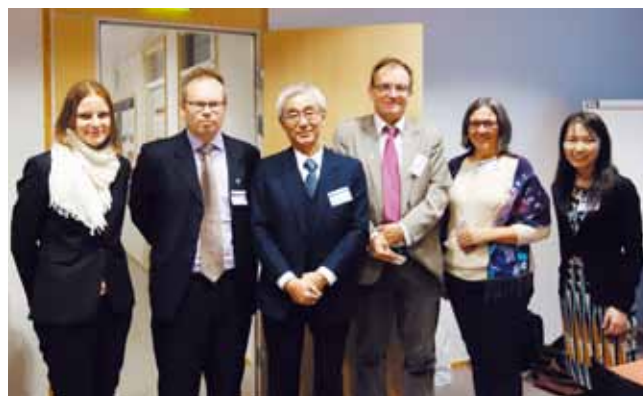
Board members of Alumni Club